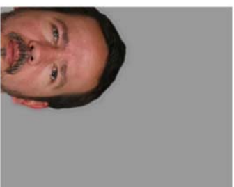
Center Subject Don't Cut Off