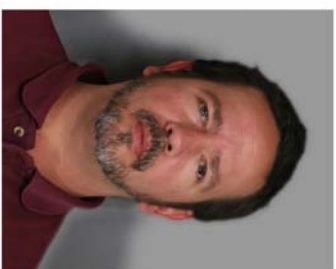
Too Close to Backdrop