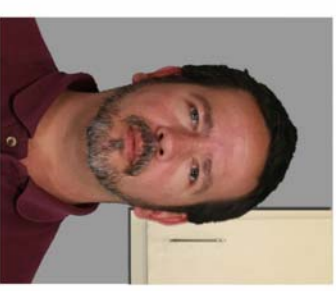
No Foreign Objects